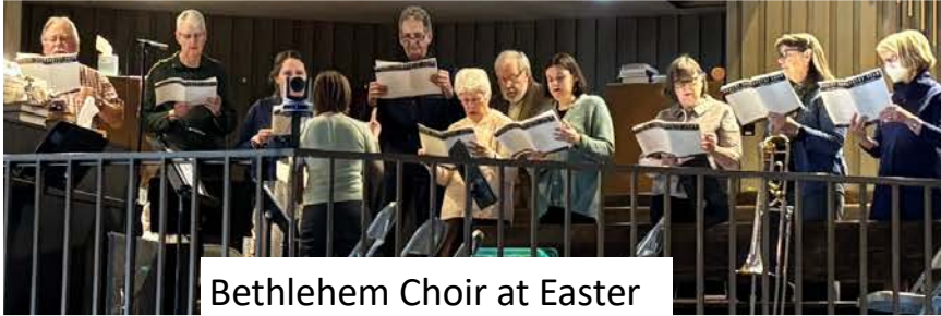
Bethlehem Choir at Easter