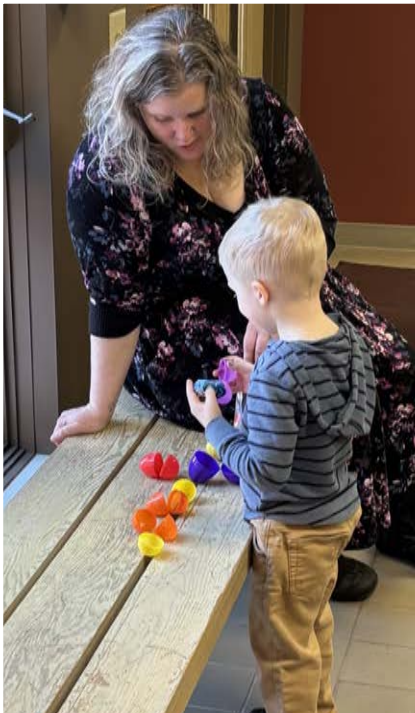
Easter Egg Hunt—huge fun and treasures to boot!