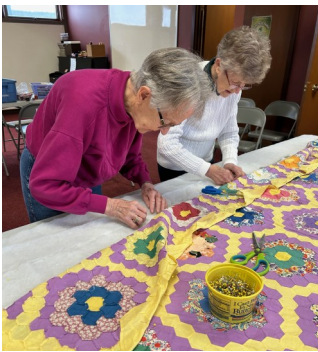
Quilt donated to Arrowhead AED fundraiser