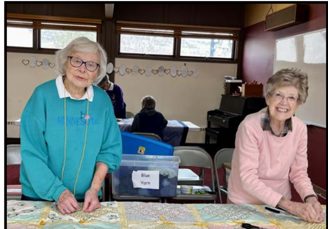
Always smiles and laughter while quilting!