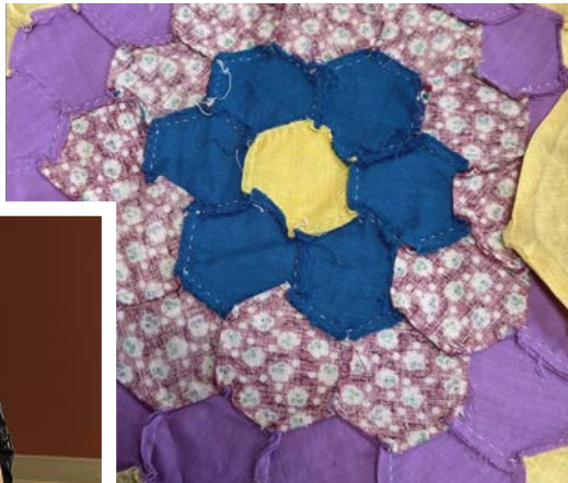
Intricately hand-pieced quilt blocks