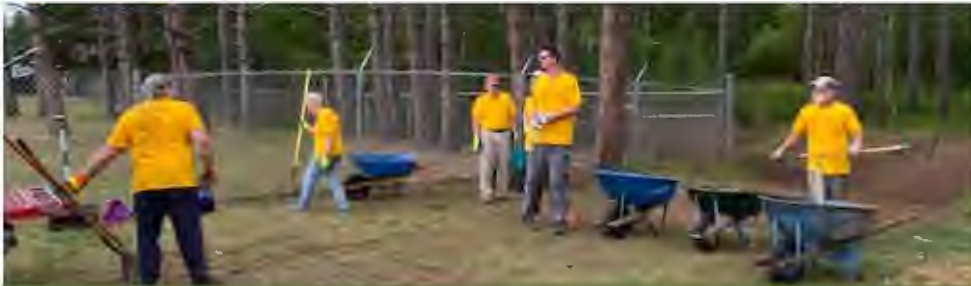
"Thank you to the team from Bethlehem Lutheran Church for their efforts on Sunday afternoon spreading wood chips in the school forest! Your help is greatly appreciated!!" - Cook County Schools