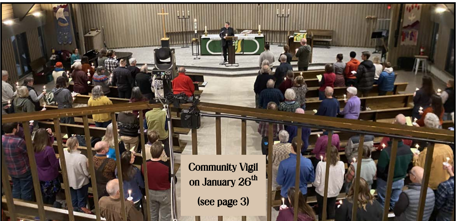
Community Vigil on January 26 th (see page 3)